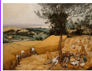
observations of everyday life