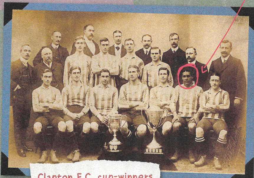
Clapton F.C. cup-winners