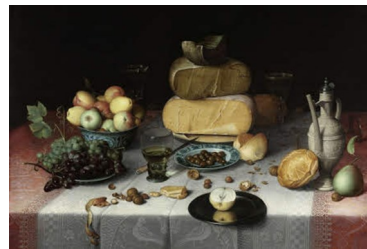
Artist: Floris van Dyck