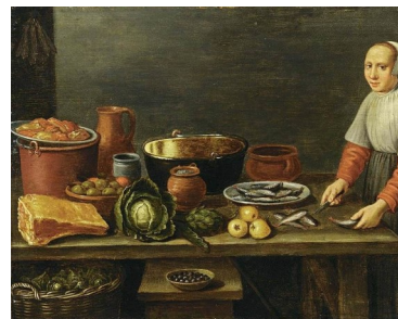
Artist: Floris van Schooten