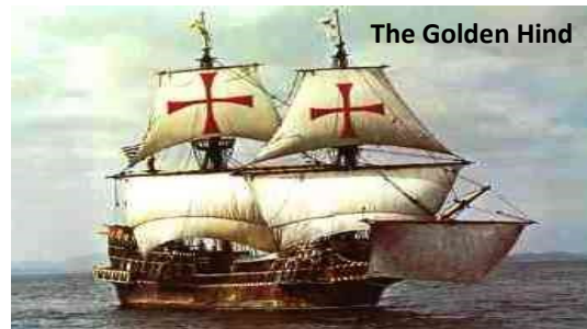
The Golden Hind