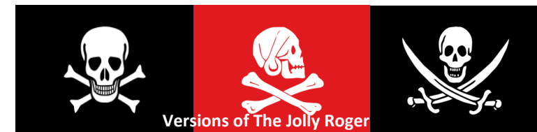
Versions of The Jolly Roger