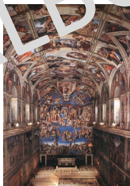
Ceiling of the Sistine Chapel—Michelangelo