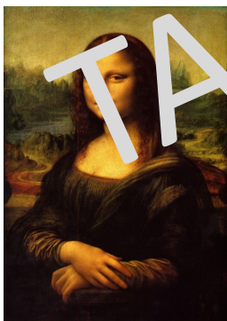
The Mona Lisa - Leonardo Da Vinci