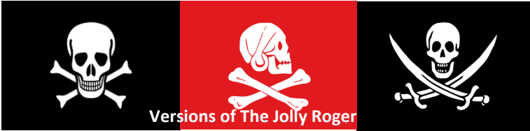
Versions of The Jolly Roger