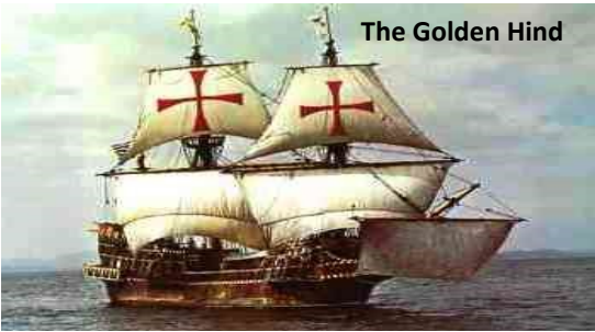
The Golden Hind