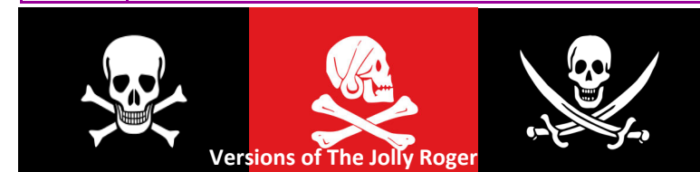
Versions of The Jolly Roger