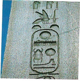
The oval enclosing the hieroglyphs that make up a royal name is called a cartouche. This one contains the name of King Tutthmosis III.