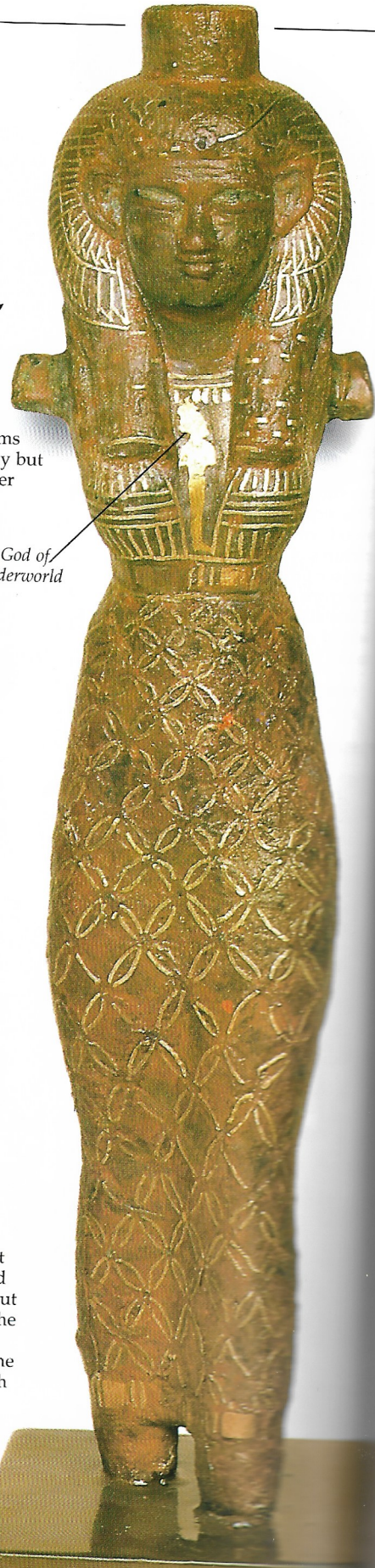
Osiris, God of the Underworld