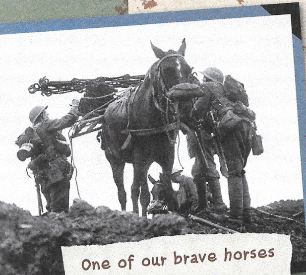
One of our brave horses